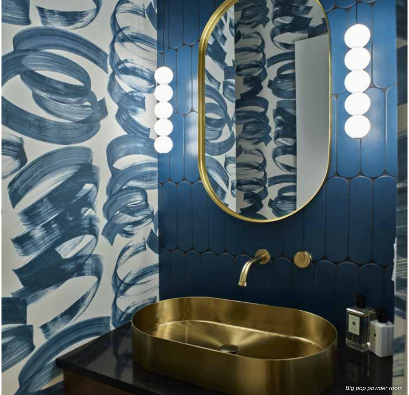
Big pop powder room